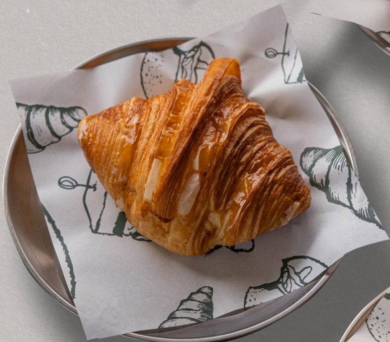
◀ CROISSANT ———— IDR 35K