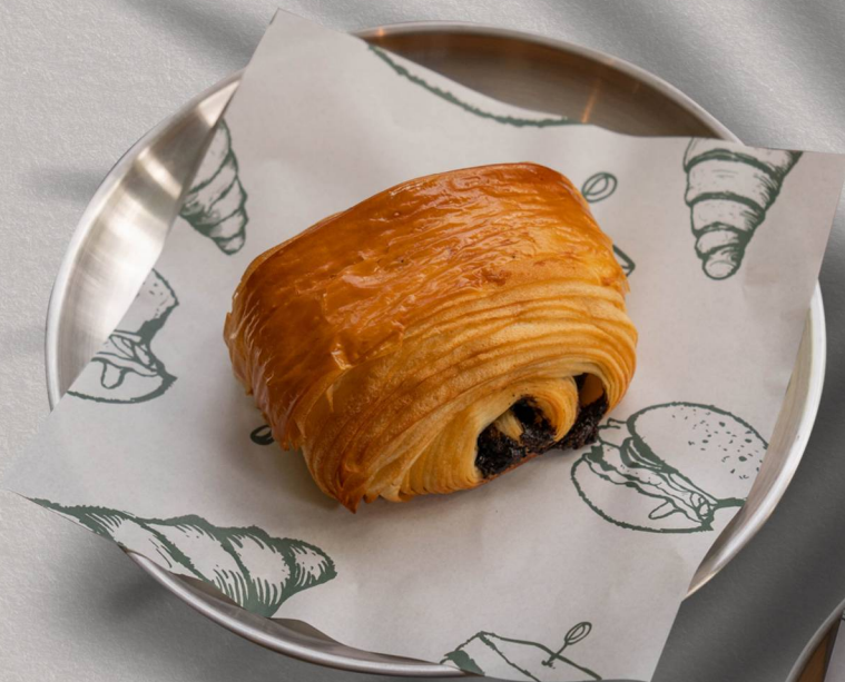
◀ PAIN AU CHOCOLAT — IDR 40K