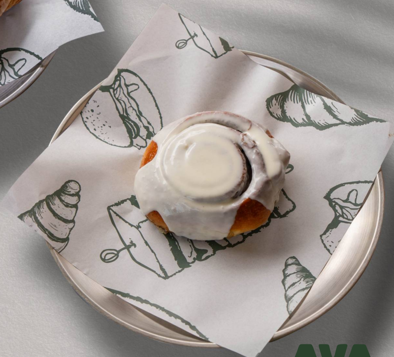
CINNAMON BUN ———— IDR 40K ▶

*PRICES IN.000 RUPIAH. SUBJECT TO 10% GOVERNMENT TAX AND 5% SERVICE CHARGE FEE