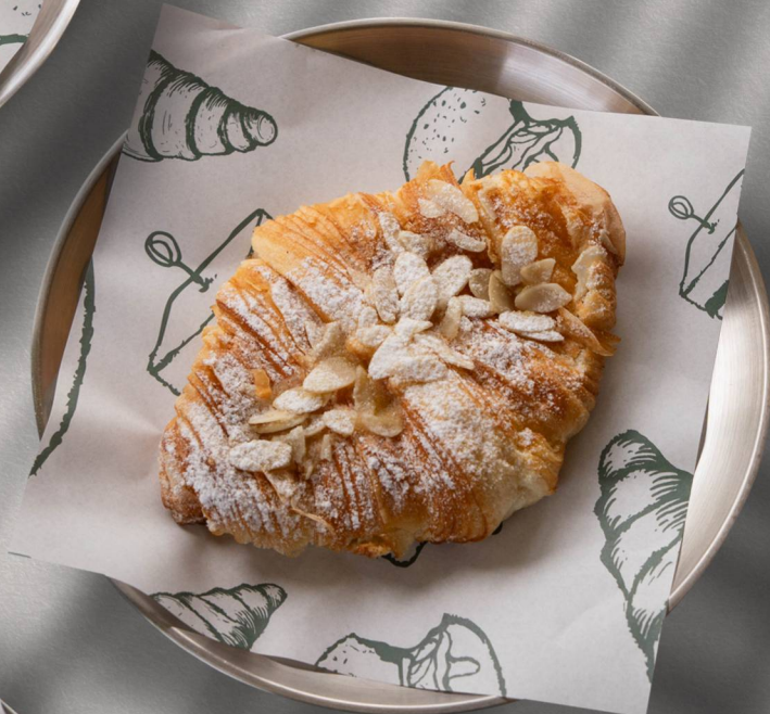
ALMOND CROISSANT — IDR 50K ▶